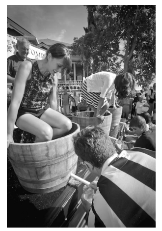
Grape Stomp competition at the 2013 Italian Family Festa

ence was very evident throughout the two days, and took on a collective family reunion. Given the times, and realities of our modern family structure, the Festa itself has become a focal point for friends and families to meet