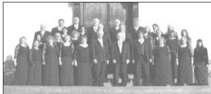
Ohlone Chamber Singers

For more information and reservations contact the IAHF office at 408-293-7122 or iahfsj@iahfsj.org .