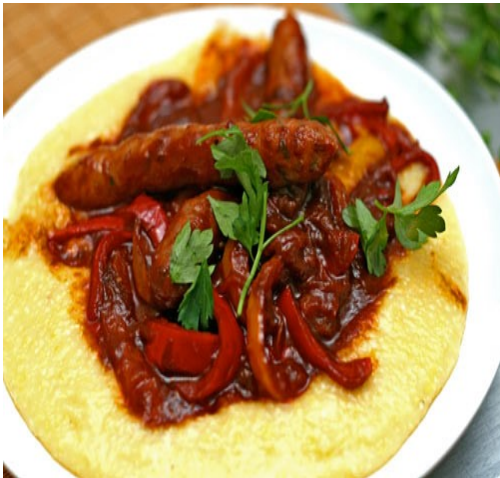
Polenta with Sausage

Menu: Mixed Green Salad, Garlic Bread, Polenta, Sausage and Dessert