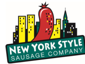
NEW YORK SAUSAGE COMPANY