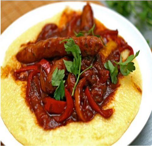
Polenta with Sausage

Menu: Mixed Green Salad, Garlic Bread, Polenta, Sausage and Dessert