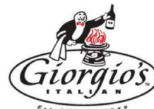
GIORGIO'S CULINARY STAGE

COMPANIES INC. JP DINAPOLI CULTURAL VILLAGE