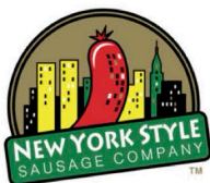
NEW YORK STYLE SAUSAGE CULINARY STAGE