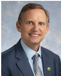
Larry Klein Sunnyvale Mayor