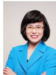
Yan Zhao Saratoga Mayor